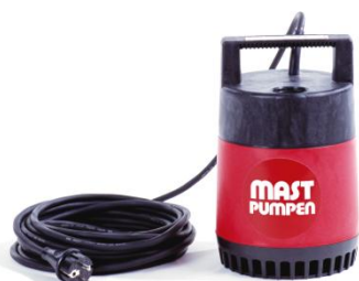
Delivery height H m (WC)