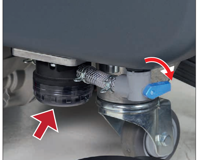
15. Clean the filter: A) Close the solution valve under the machine. B) Remove the transparent cover and the gasket, then remove and clean the filter inside. C) Reassemble the filter.