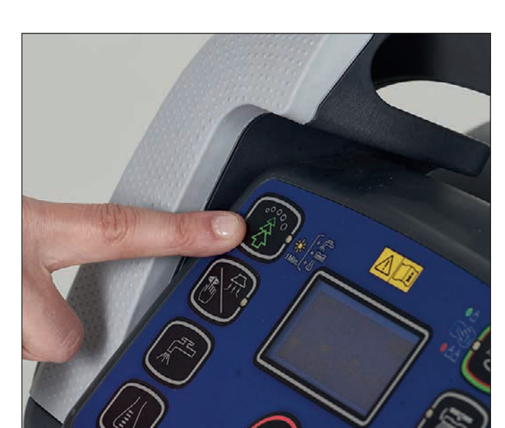
11. Press the EcoFlex™ button whenever you temporarily need a greater cleaning power.