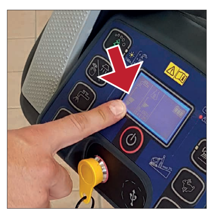
2 Check if there isn't any brush motor overload "WARNING ALARM F2" on the display.