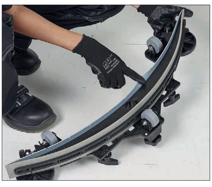
16. Press the click-off button and wait 17. Take the squeegee off and remove debris. Check and clean the squeegee blades.