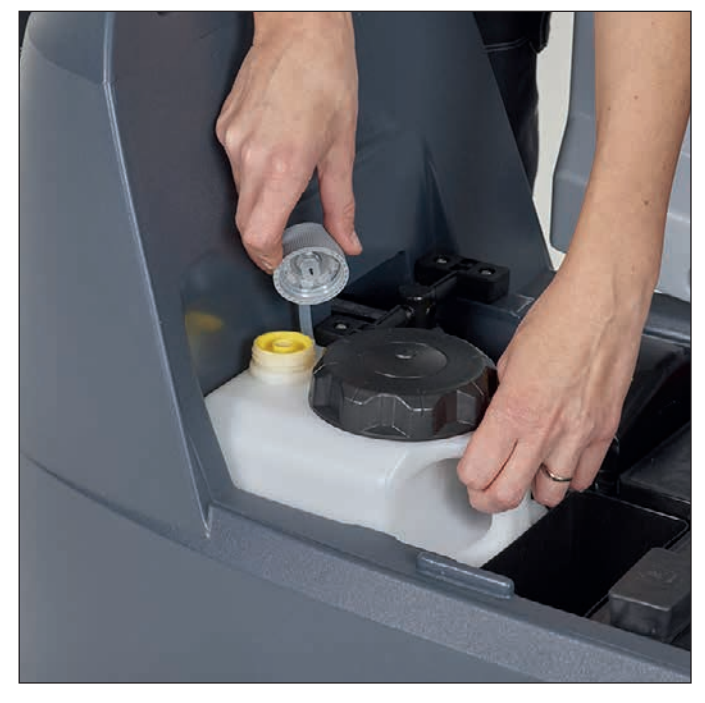
4 Check the EcoFlex system is cleaned, eventually purge the system.