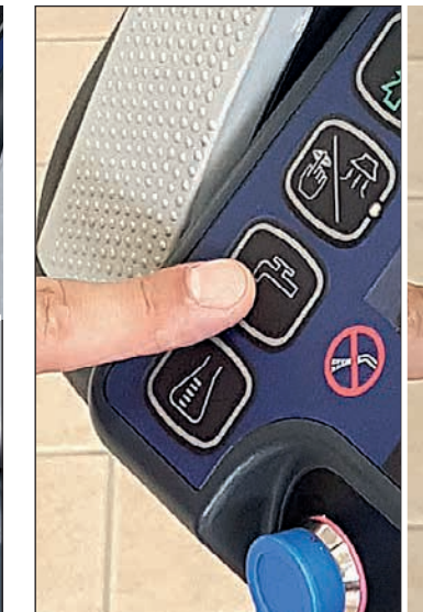
9. To change the solution flow level push the solution button and change flow level according to the cleaning performance and application.