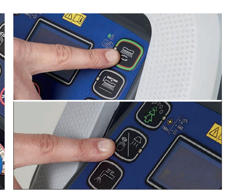
10. If necessary press the extra pressure function (hold for one second). If necessary press the silent mode button for extra low sound level.