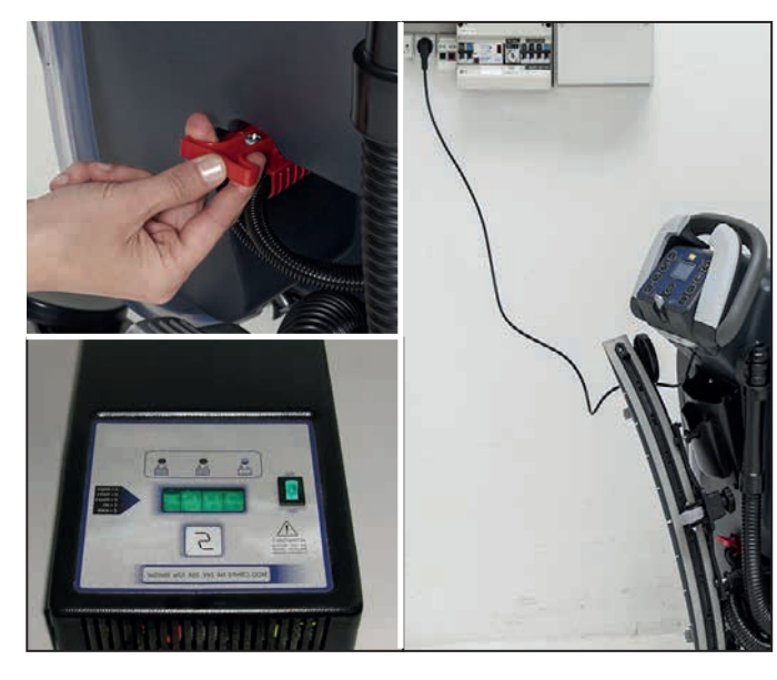
battery charger cable to the electrical socket.