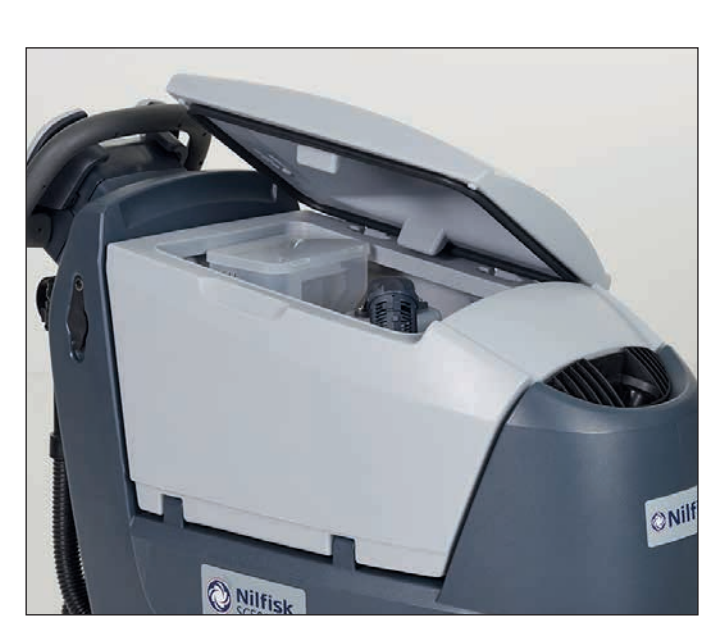
19. Charge the batteries: Connect the 20. Park the machine with the recovery tank cover open.

If the machine has been used until the Red light illuminates on the battery level indicator on the machine, a full recharge of the batteries (10-12 hours) will be required. Failure to carry out this procedure may cause damage to the batteries. Charging the batteries after every use is recommended.