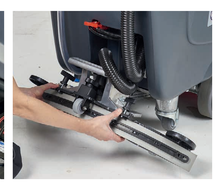
4. Install the squeegee and fasten it with the knob.