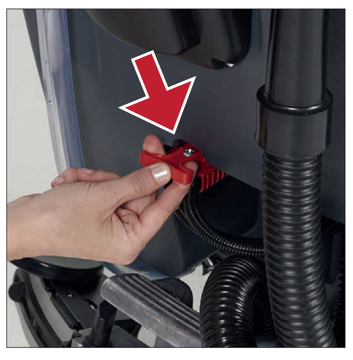
Check if the power cable is correctly connected.