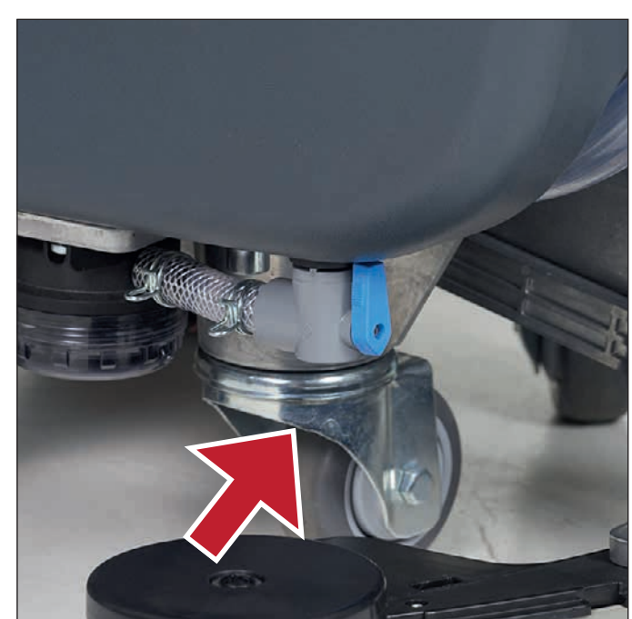
2 Check if the solution valve is open. 3 Check if the solution filter is