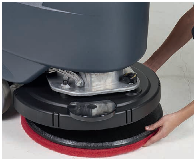
5. Place the brush or the pad-holder under the deck. Use the appropriate brush to clean the floor.