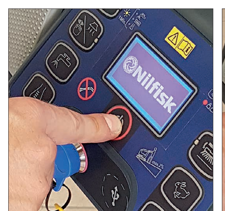
3 Restart the machine without pressing the paddle.