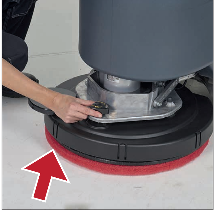
1 To adjust machine direction turn front knob until machine is working straight.