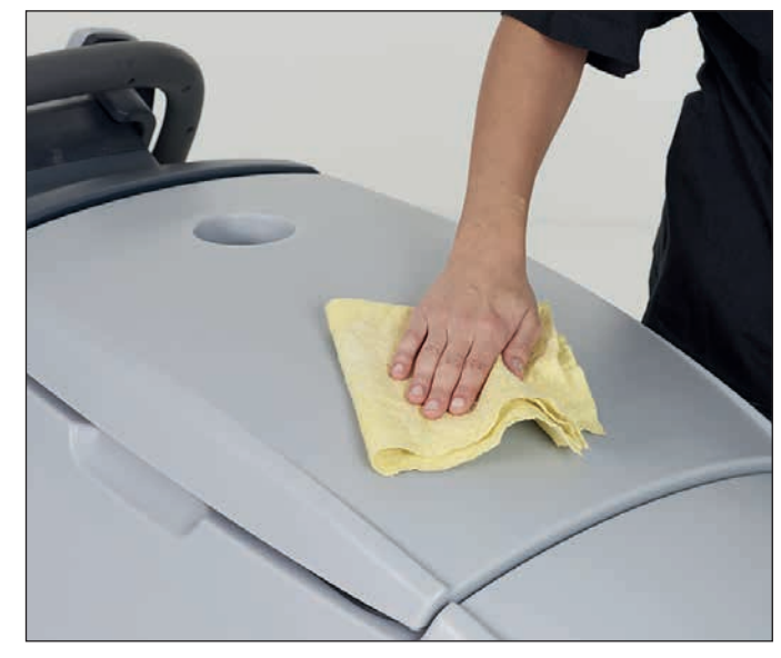
18. Clean the machine using a damp cloth and where needed use a neutral cleaning product.