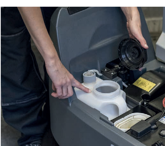
tergent suitable for cleaning machines (highly concentrated and low foaming detergent).