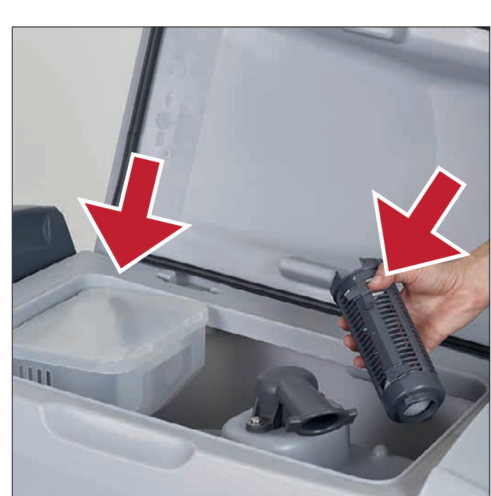
2 Open the recovery tank and check 3 Check if squeegee blades are the debris tray and float are clean and working.