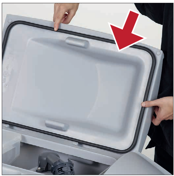
4 Check the lid gasket is in good and working condition and sealing when lid is closed.