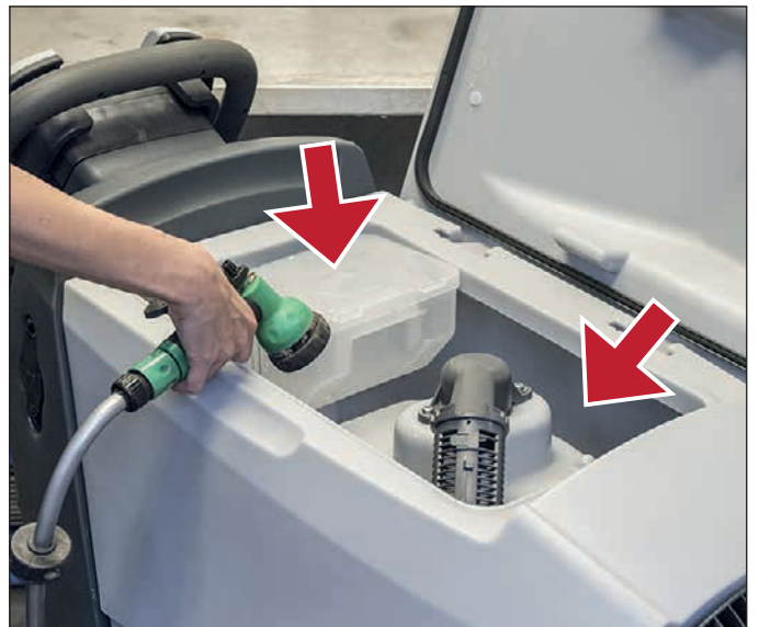
14. Empty the debris tray and clean/ wash the recovery tank inside.