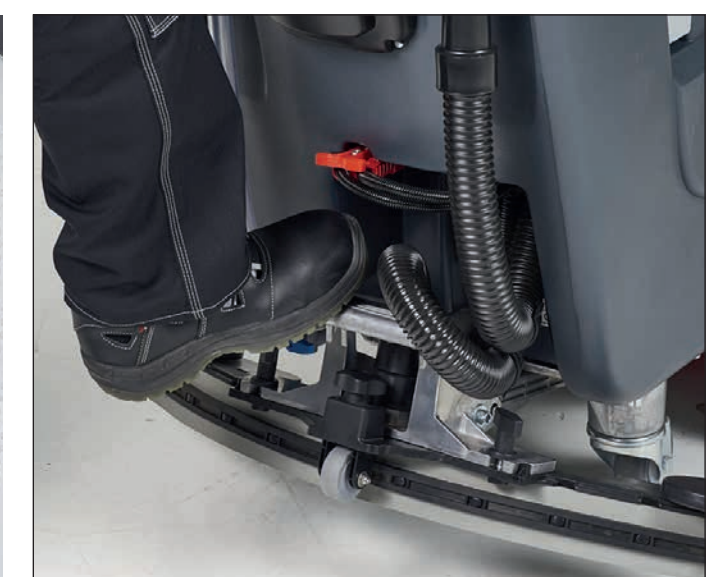
7. Lower the squeegee with the pedal. 8. Push forward the drive paddle to