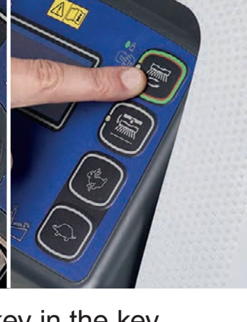
6. Place the user key in the key reader, then start the machine by pressing the One-Touch button. To engage the brush, slightly press the drive paddle and then release it.