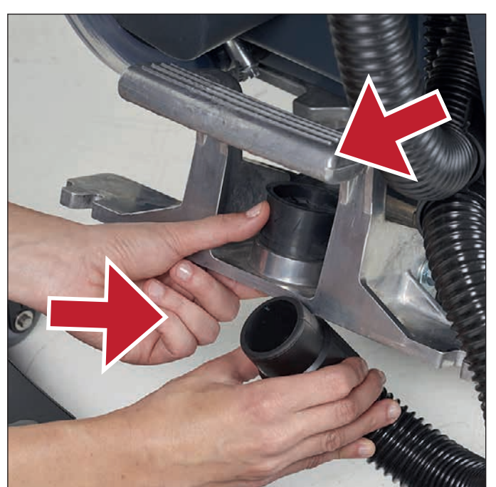
Check if the suction hose is correctly installed and cleaned.