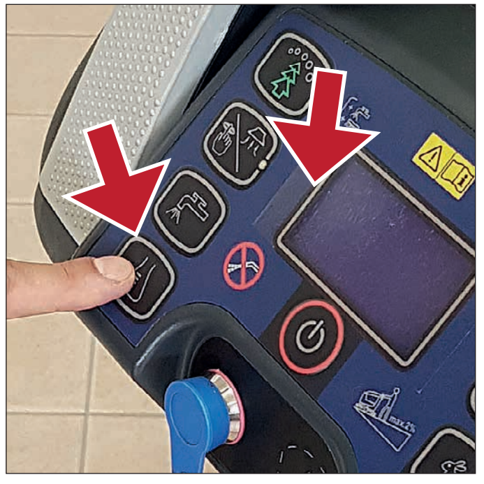
Check if you have the right detergent and water settings.