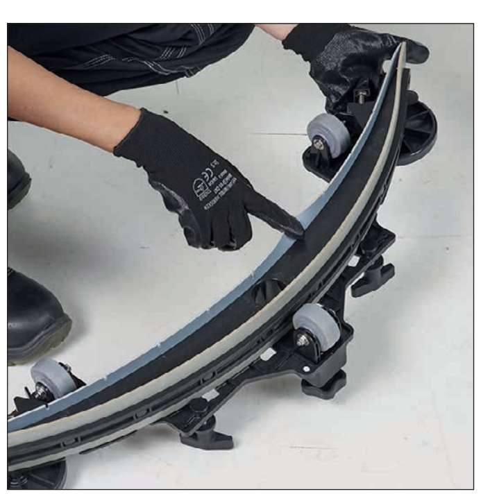
damaged or dirty.