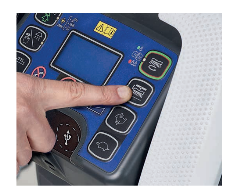
for the brush/pad holder to fall on the floor. Remove to clean or change brush.