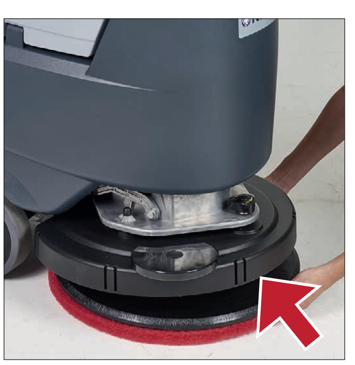
3 Check if the brush are correctly installed and not worn out or if there are external materials avoiding brush rotating.