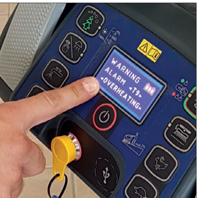
4 Check floor inclination is not exeeding specifications.