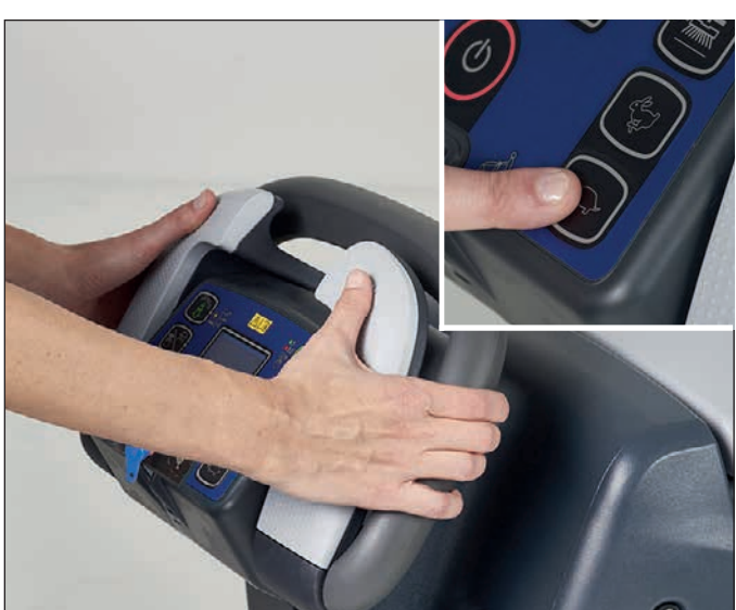
start cleaning. Adjust maximum speed by the speed regulation buttons.