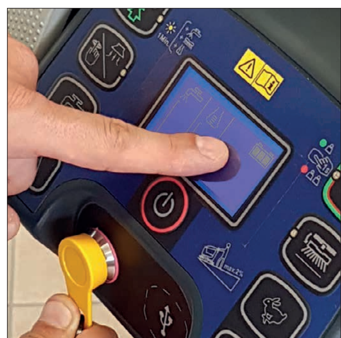
2 Check if the battery is charged.